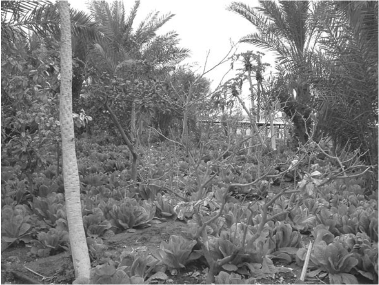
1. Garden of St Gerasimus, near the banks of the River Jordan

to as many monasteries as possible that were open to pilgrims and visitors. Among these was the monastery of St George Choziba, perched on a narrow ledge halfway up a cliff in the wadi Qilt, between Jerusalem and Jericho. A twelfth-century pilgrim, John Phokas, describes the approach from the road as 'a place about which no report will be believed, and only when one sees it can one understand its wonders . . . the church and cemetery are set in the chasm of the rock, and everything is so blasted by the burning sun that one can see the rock emitting tongues of flame like pyramids.' Perhaps Phokas was letting his imagination run a little wild, but in the heat of a mid-September day in the Judean desert one can appreciate his metaphorical language. Even so, the discomfort was worth the effort just to experience the stunning reality of the place.